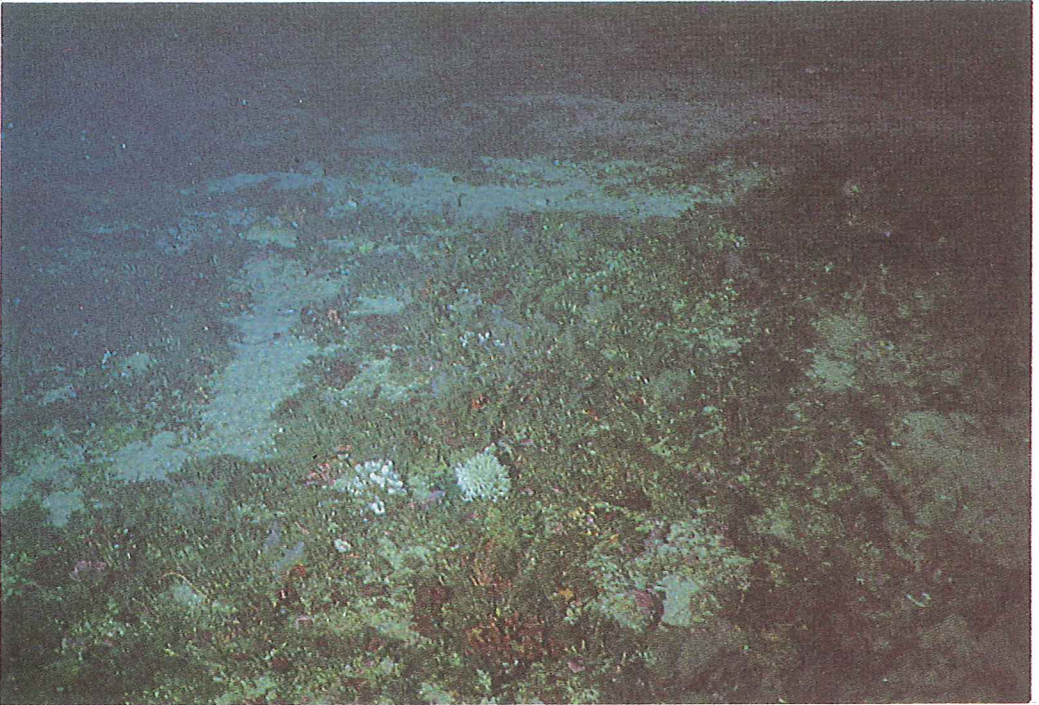
Figure 2. A hard-bottom area at 50-60 m depth in James Island Area Block 463 (center of block at 32°29'58"N, 78°49'43"W) colonized by a dense mat of the polychaete Phyllochaetopterus socialis and associated organisms.