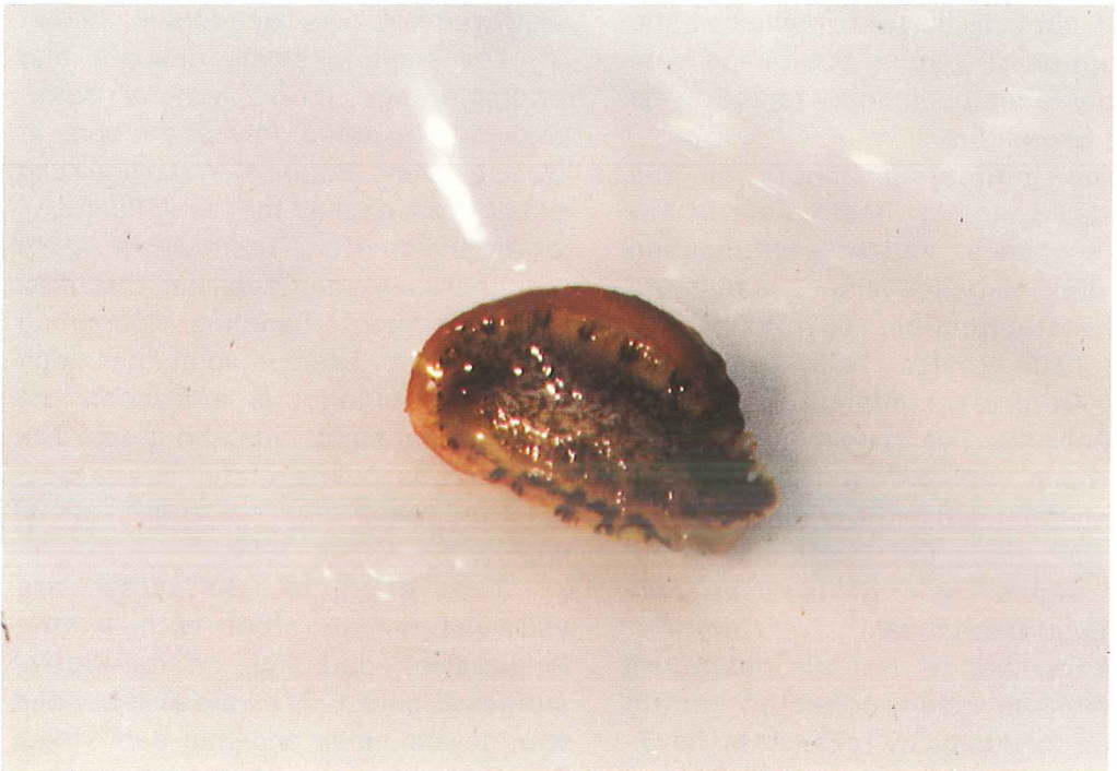
Figure 2. Ventral view of Haliotis pourtalesii Dall, 1881. Note that foot is folded medially.