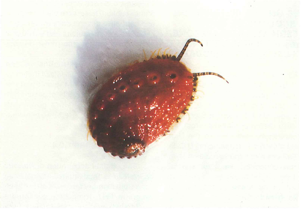
Figure 1. Dorsal view of Haliotis pourtalesii Dall, 1881.